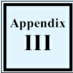
Table of Precedence

The Table of Precedence is related to the rank and order of the officials of the Union and State Governments. The present notification on this subject was issued on 26 July, 1979. This notification superseded all the previous notifications and was also amended many times. The updated version of the Table, containing all the amendments made therein so far (2016), is given below: